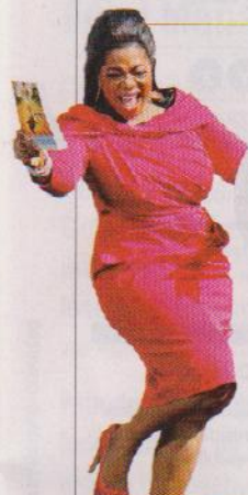
Oprah's World Behind her brand power p20